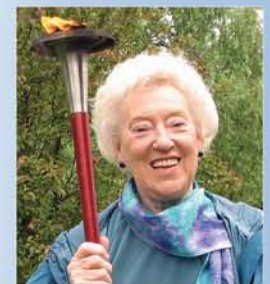
Hon. Flora MacDonald