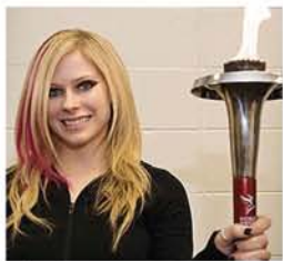
Avril Lavigne Aclaimed Singer Musician