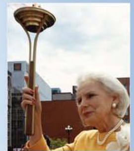
Rt. Hon. Jeanne Sauvé

Athletes and non-athletes, young and old alike, can carry the torch a few steps, a few blocks or a few miles. Join one of the thousands of welcoming ceremonies along the global route. Share your hopes for inter-cultural peace: come hold the torch and take a few steps for world harmony.