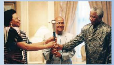
Former President Nelson Mandela and his wife Mama Graca Machel with Sri Chinmoy.

An athlete, philosopher, artist, musician and poet, Sri Chinmoy dedicated his life to advancing the ideals of world friendship and harmony.