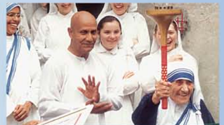
Mother Teresa and Sri Chinmoy celebrate the spirit of harmony.