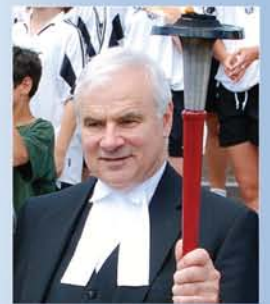
Hon. Peter Milliken, MP