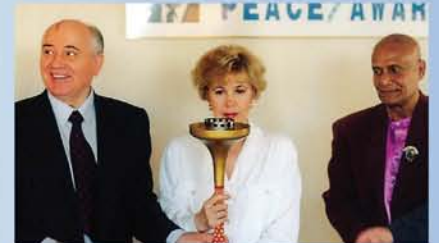
Former President Mikhail Gorbachev and his wife Raisa Maximovna with Sri Chinmoy.