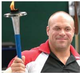
Hugo Girard World Champion Strongman